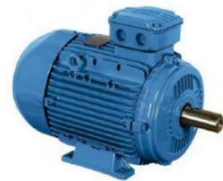
THREE PHASE INDUCTION MOTOR

B Write the name of the following tools & accessories