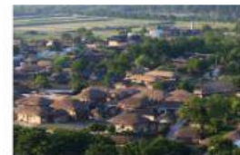
places where people live in the countryside, smaller than a town