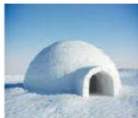
a circular house made of blocks of hard snow