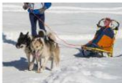
a sledge pulled by dogs