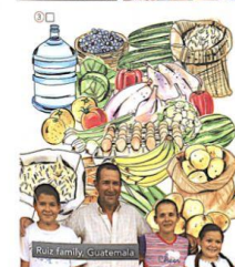
Ruiz family, Guatemala