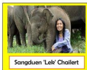
Sangduen 'Lek' Chailert

B. Complete the text with the correct form of the words in bold. You can add suffix to the end of a word in order to form a different word. Example full, al, ous, ive, able, cial