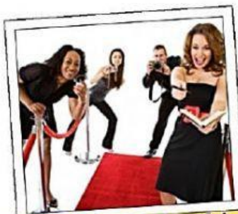
Can fame be harmful to the celebrities?

What about the celebrities themselves? A study in the USA tried to measure narcissism or extreme self-centredness, when feelings of worthlessness and invisibility are compensated for by turning into the opposite: excessive showing off. Researchers looked at 200 celebrities, 200 young adults with Masters in Business Administration (a group known for being narcissistic) and a nationally representative sample using the same questionnaire. As was expected, the celebrities were significantly more narcissistic than the MBAs and both groups were a lot more narcissistic than the general population.