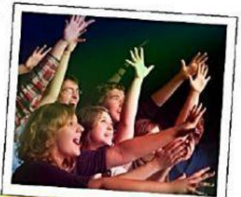
Researchers have identified three kinds of fans

That leaves 2% of young people with a 'borderline-pathological' interest. They might say, for example, they would spend several thousand pounds on a paper plate the celebrity had used, or that they would do something illegal if the celebrity asked them to. These people are in most danger of being seriously disturbed.