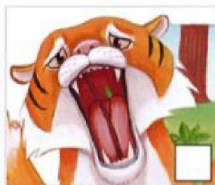
sticks in his mouth