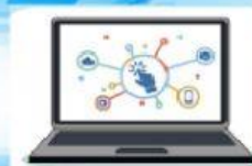
4. a laptop