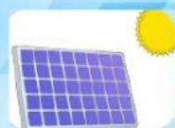
1. a solar panel