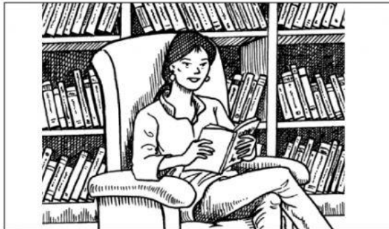
Hannah drama English