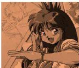
Cat Girl Nuku Nuku

II. Listen to the audio about new Superheroes and choose the correct answers.