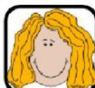
LYN - 18