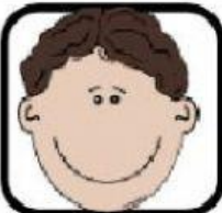
MARK - 7