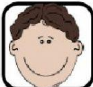
MARK - 7