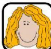
LYN - 18