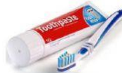
Toothbrush and toothpaste