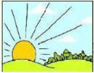
In the morning (6:00 AM - 12:00 PM)