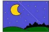
At night (10:00 PM - 6:00 AM)