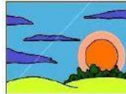
In the evening (6:00 PM - 10:00 PM)