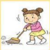
SWEEP THE FLOOR