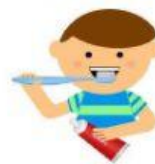
Brush your teeth

5. Select what you should use to brush your teeth: