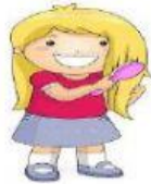
Comb my hair