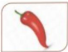
Red Hot Chilli

Use two or three words from the box to describe each picture.