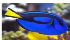
Blue tang fish