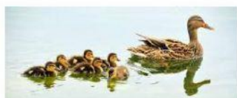
Duck and ducklings