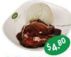
Traditional Grilled Chicken w/ Black Pepper Sauce