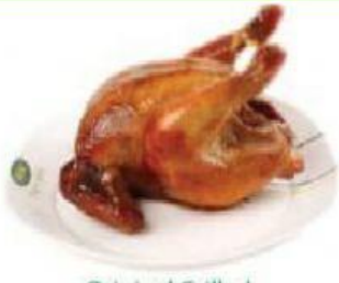
Original Grilled Chicken