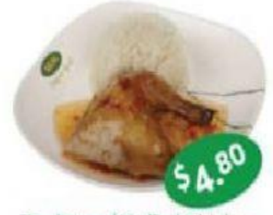
Traditional Grilled Chicken w/ Sweet Chilli Sauce