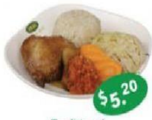
Traditional Ayam Penyet