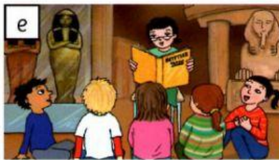
Story time is at