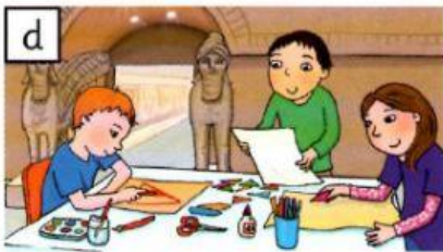
Art is at