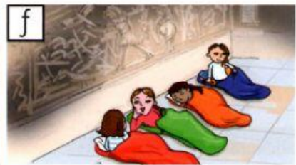
Bedtime is at