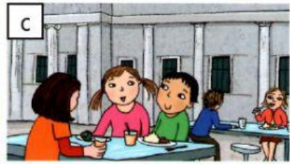
Dinner is at