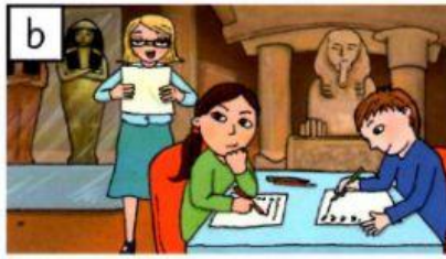
The quiz is at