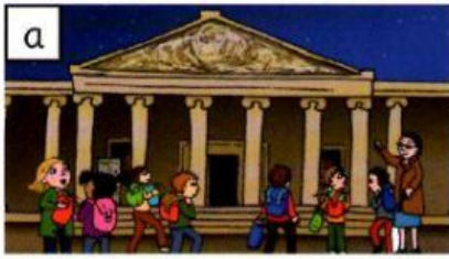
The Big Night starts at half past six.