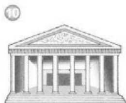
t m l