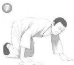
s r a t