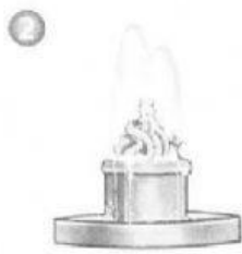
fu t i