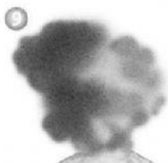
s o e