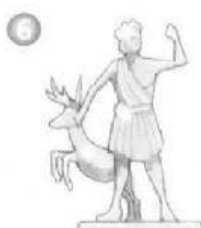
s a u