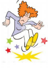
I can't dance