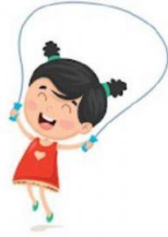
I can skip.