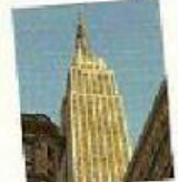
the Empire State Building