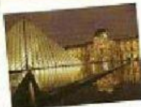
the Louvre Museum