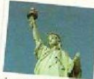
the Statue of Liberty