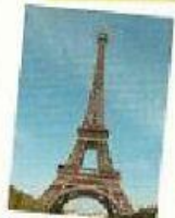
the Eiffel Tower