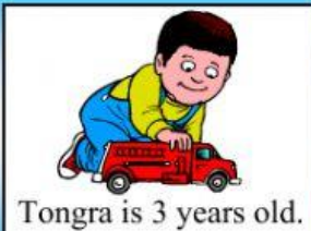
Tongra is 3 years old.

Two days ago Tongra sat in a bus for many hours with the air condition turned up very high. Now he is coughing all day.