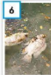
in the water

The pictures all show examples of _____.