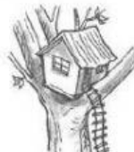
a tree house