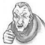
an old man

b) Look, choose and circle two bad characters.