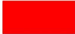
r e c t a n g l e