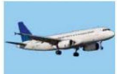
This is an aeroplane.