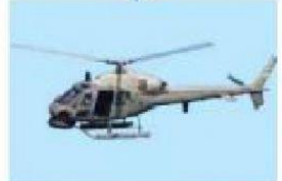
This is a helicopter.