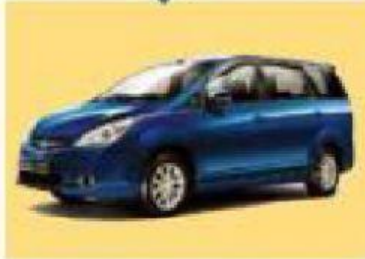
This is a car.