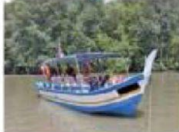
This is a boat.