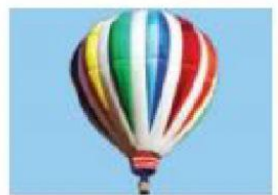
This is a hot air balloon.