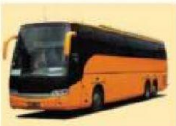
This is a bus.