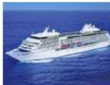
This is a ship.