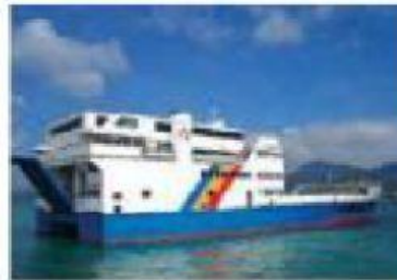
This is a ferry.