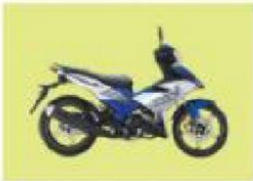
This is a motorcycle.