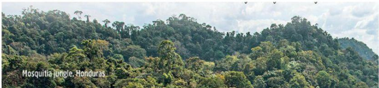
Mosquitia jungle, Honduras

What will be discovered next—and where? Look around you. Do you have any ideas?