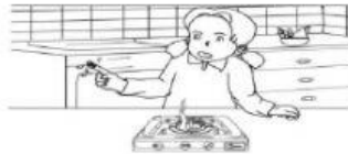
get a burn