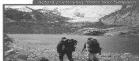
Actors portraying Yates and Simpson