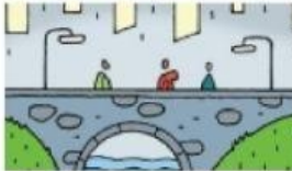
4 train station