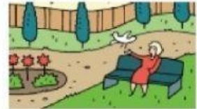
7 bus station

2 ★★ Read the clues and write the places.