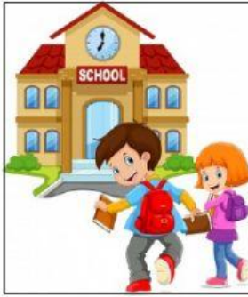
go to school