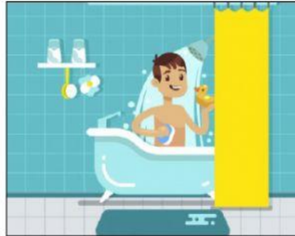
take a bath