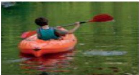
CANOE ON A RIVER