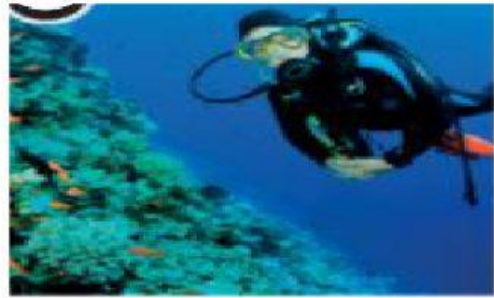
DIVE NEAR A CORAL REEF