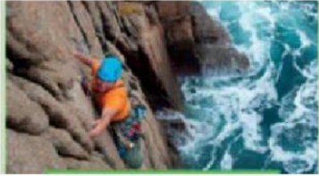
CLIMB A CLIFF