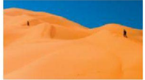
TREK ACROSS THE DESERT