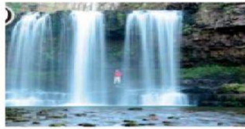
WALK UNDER A WATERFALL