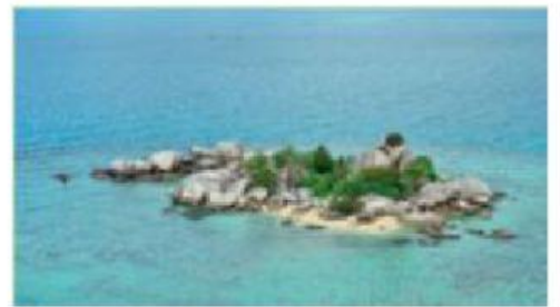
EXPLORE AN ISLAND