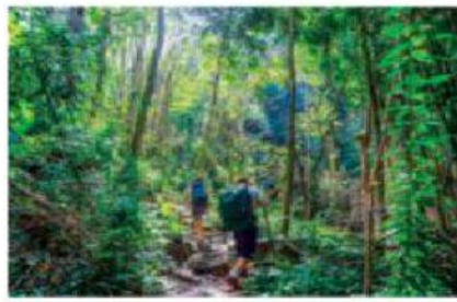
EXPLORE A JUNGLE