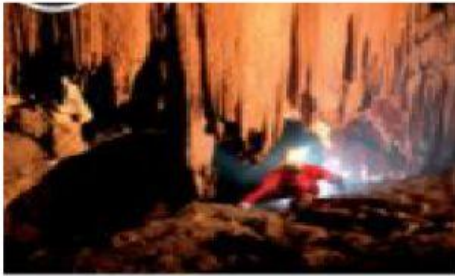
EXPLORE A CAVE