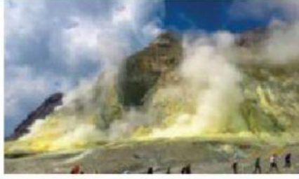
CLIMB A VOLCANO