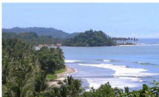
Tanjung Setia Beach

Lampung is not only famous for its Way Kambas National Park. One of the best tourist attractions of this province is Tanjung Setia Beach. This beach is located in the village of Tanjung Setia, West Lampung district, Lampung province. It is about 273 km or about six to seven hour driving from Bandar Lampung, the capital city of Lampung province.