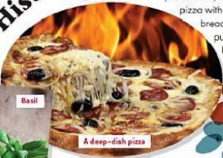
A deep-dish pizza

The word "pizza" comes from Italy. The name of one of the first pizzas in the world is Pizza Margherita. It is from Italy. It has white cheese, red tomatoes, and green basil. White, red, and green are the colors of the Italian flag. Pizza Margherita looks good. It tastes good, too!