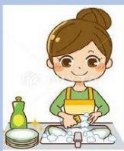
wash the dishes