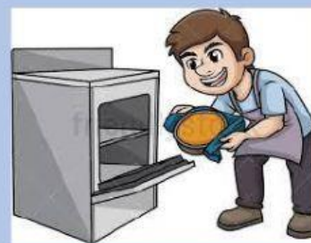
bake a cake