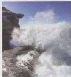
0 sea / river