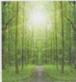
1 forest / city