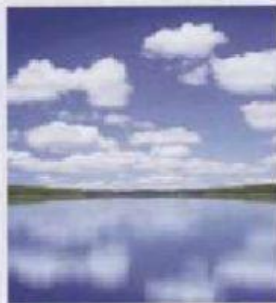
5 lake / beach

2. Complete the sentences with the words in the box. There are two extra words