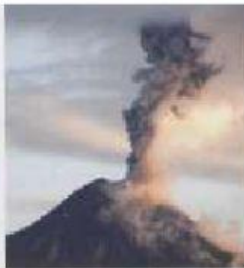
2 volcano / island