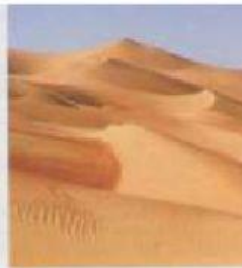
3 desert / waterfall