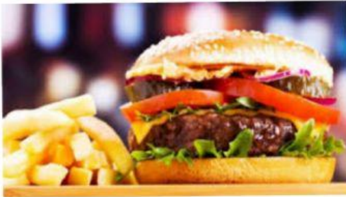
Fried chips and burger