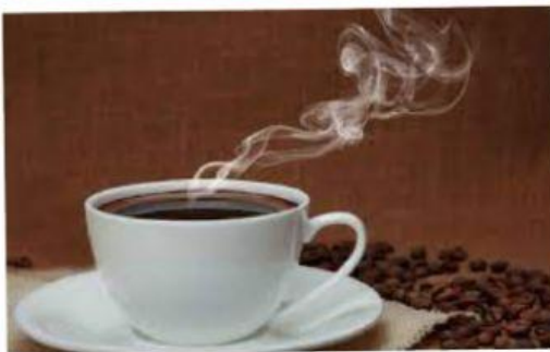
A cup of coffee