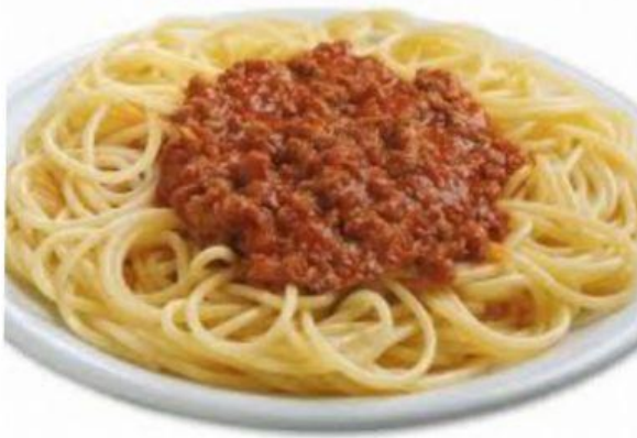
Pasta or noodles