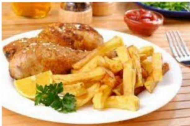
Roast chicken with fried chips