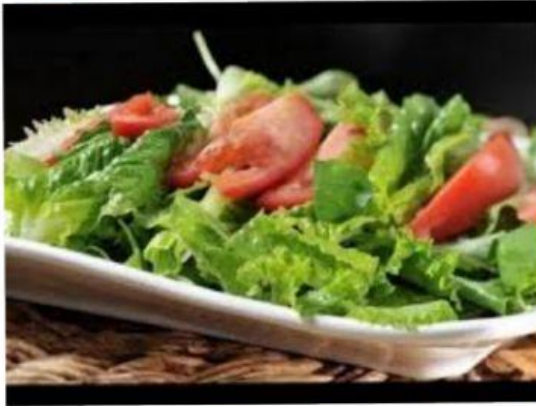
Tomato and lettuce salad