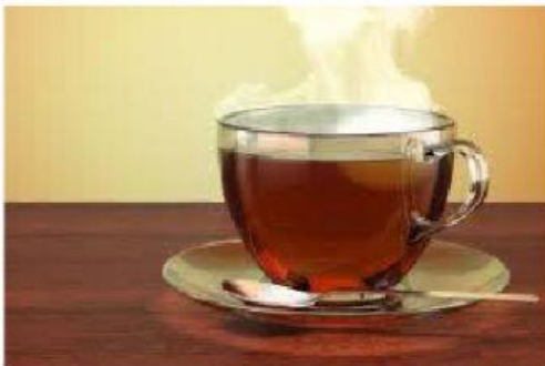
A cup of tea