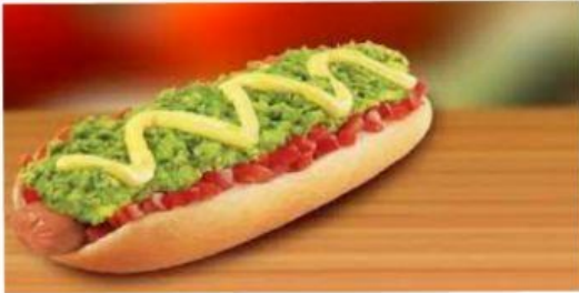
Special hot dog