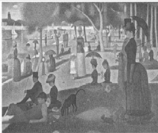
Sunday Afternoon on the Island of La Grande Jatte, 1884-86, Georges Pierre Seurat

Look at the painting again. Read the museum guide's description of it. Write the verbs in the present continuous.