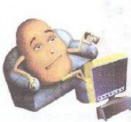
a couch potato

Listen to Dan, Jean, Sally, and Phil discuss sports and exercise. Who is a couch potato? a fitness freak? a sports nut? a gym rat?