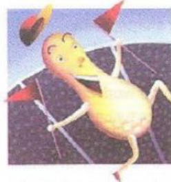
a sports nut