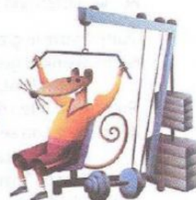
a gym rat