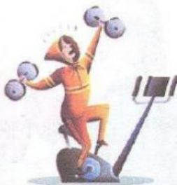
a fitness freak