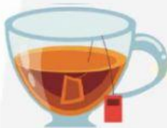
A cup of tea