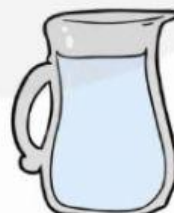
A jug of water