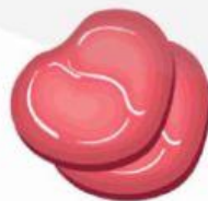
A kilo of meat