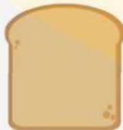
A slice of bread