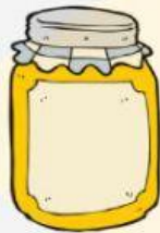
A jar of honey