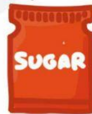
A kilo of sugar