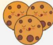
A pile of cookies