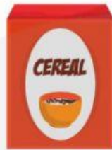
A box of cereal