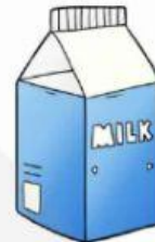
A carton of milk