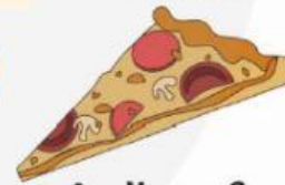
A slice of pizza