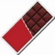
A bar of chocolate