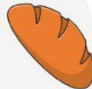
A loaf of bread