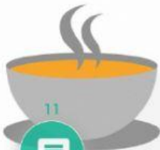
A bowl of soup