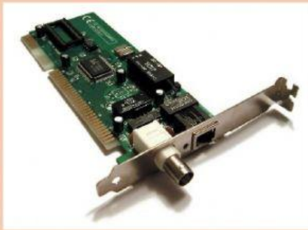
Network interface card

The devices which are used to exchange the processed data and information are called communication devices.