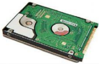
Internal hard disk