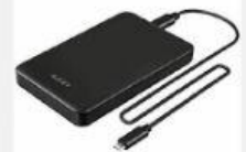
External hard disk