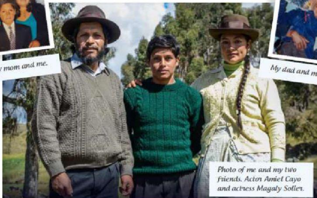
Photo of me and my two friends. Actor Amiel Cayo and actress Magaly Solier.