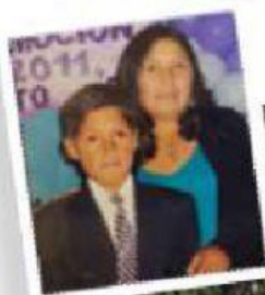
My mom and me.