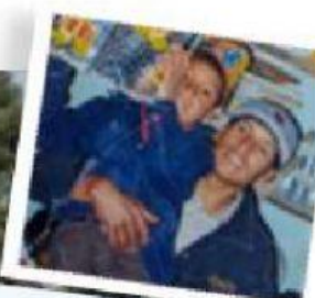
My dad and me.