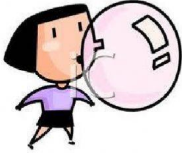
(chew the gum)