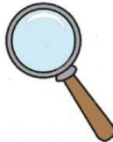
a magnifying glass