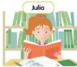
2 Julia was at the restaurant.