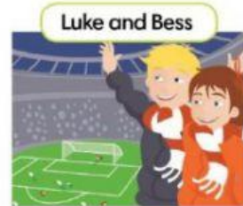
4 Luke and Bess were at the museum.