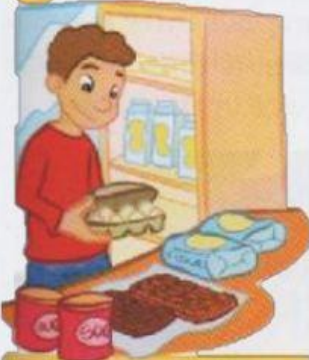
I can count them