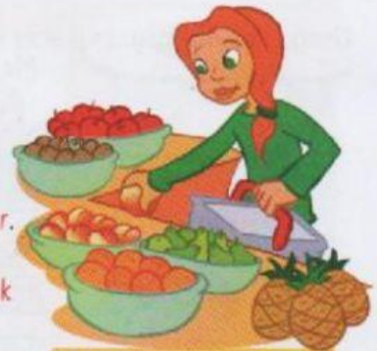
I can't count them

We need a pear and an orange . We need two peaches and an apple . We need some kiwis for the fruit salad And a big, big pineapple !