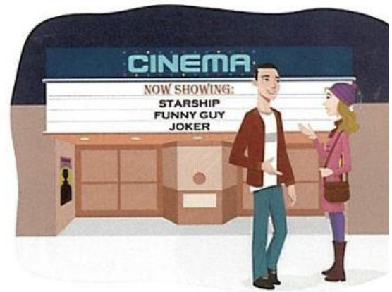
Figure it out

Carl Hey, don't spoil it for me. Let's just go see it.