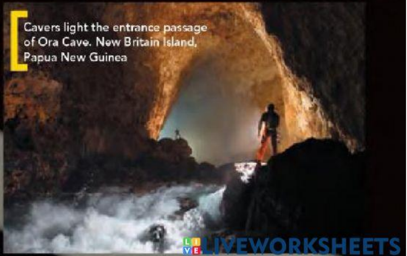
Cavers light the entrance passage of Ora Cave. New Britain Island, Papua New Guinea