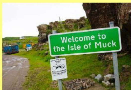
The Isle of Muck, Scotland