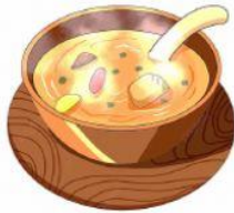
4. juice _____