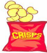
5. burger _____