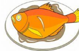
6. soup _____