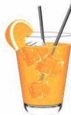
8. chicken _____