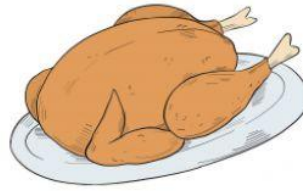
2. fish _____