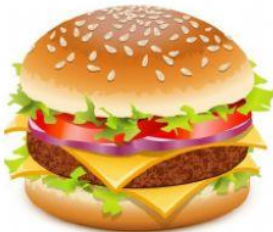
7. cheese _____