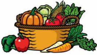
1. eggs vegetables

Look at the pictures. Correct the words.